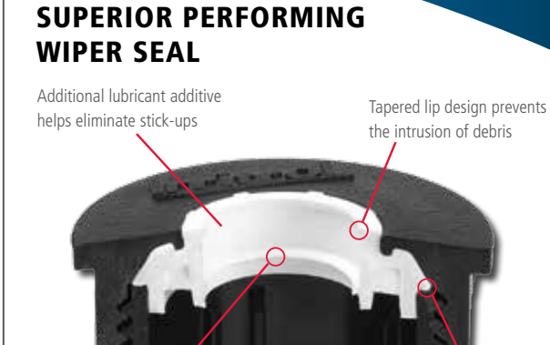
Pressure-activated lip seal ensures a positive seal around the riser and reduces "flow-by"

Lip creates positive seal to prevent body to cap leaks