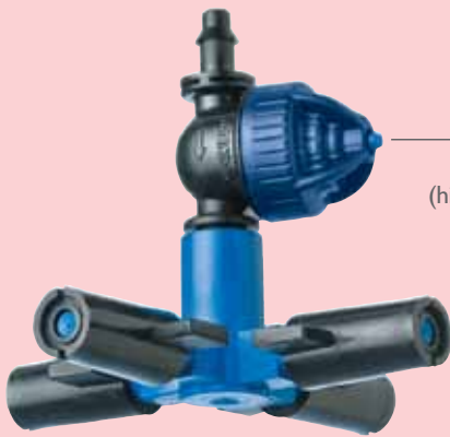
Super LPD (high pressure)

For optimal cooling or humidifying of greenhouses