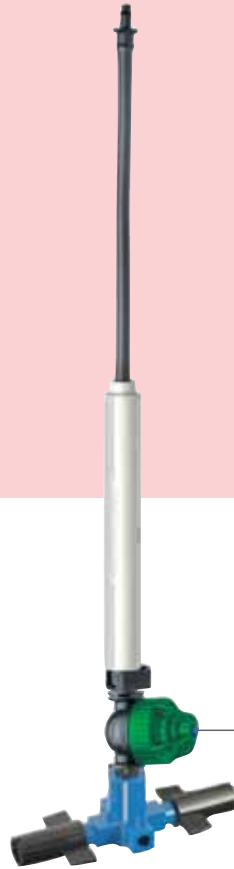
Super LPD (medium pressure)